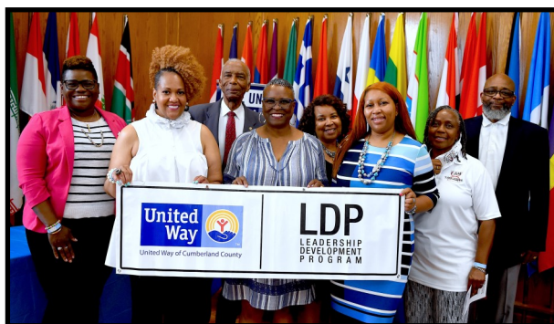
UWCC LDP Alumni attending 2021 Graduation

FTCC Tony Rand Student Center Multipurpose Room