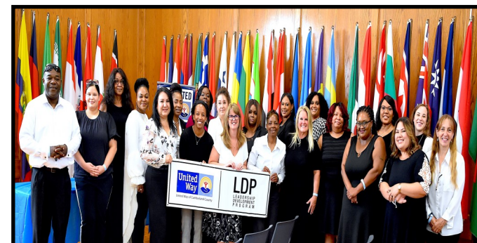
2021 Leadership Development Program Graduates

Training and placing volunteer leaders onto local boards and committees